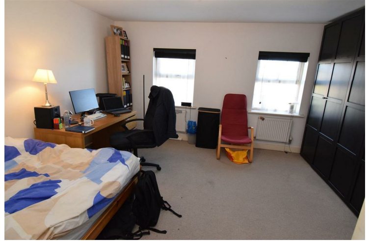
Good size front bedroom with fitted floor to ceiling wardrobes, a radiator, two double glazed front windows and a door to: