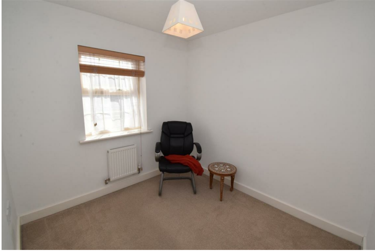
Rear bedroom with a radiator and double glazed window.