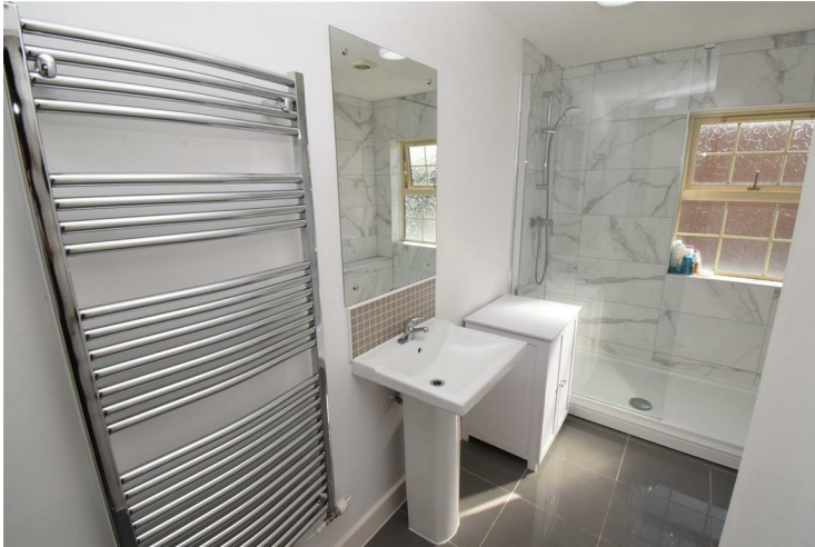
Three piece suite comprising shower, wash hand basin and WC. With tiled splashbacks and flooring, an extractor vent, heated towel rail, built in storage cupboard and a double glazed rear window.