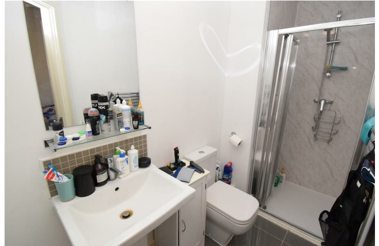
Three piece suite comprising shower, wash hand basin and WC. Tiled splashbacks and flooring, a heated towel rail and an extractor vent.